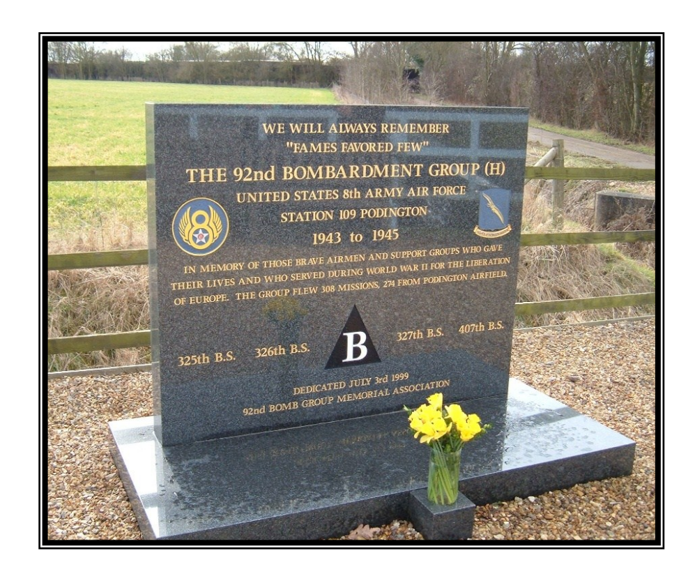
"Fame's Favored Few"

Office of the Wing Historian 92d Air Refueling Wing Fairchild Air Force Base, Washington 509-247-5953 92ARW.HO@us.af.mil As of 3 October 2014